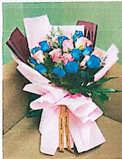
Sample for the female floral bouquet