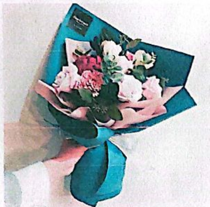
Sample for the male floral bouquet