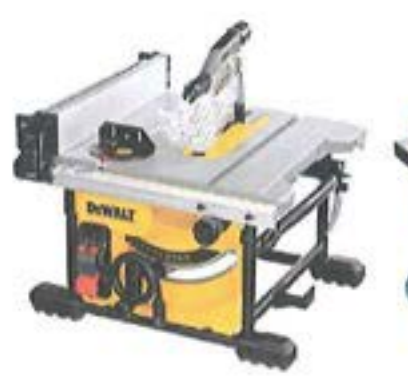
Item 10. Table Saw