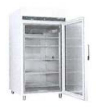
Item 3. Laboratory Refrigerator