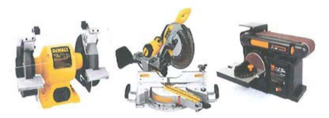
Item 7. Heavy Duty Grinder