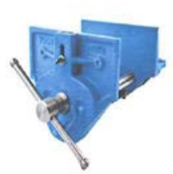
Item 16. Rapid Acting Vise