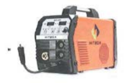
Item 15. Flux Cord Welding Machine