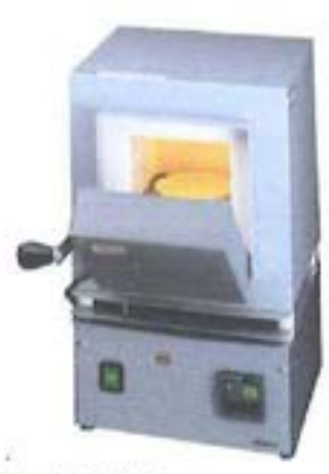
item 2. Muffle Furnace