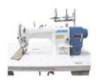
Item 18. High Speed Lockstitch Industrial Sewing Machine