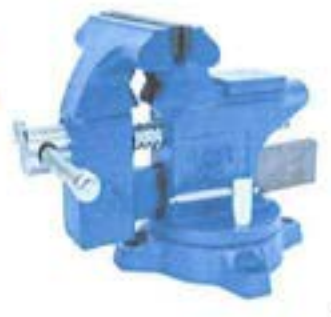
Item 17. Table Vise