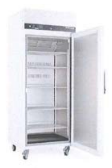
Item 4. Laboratory Freezer