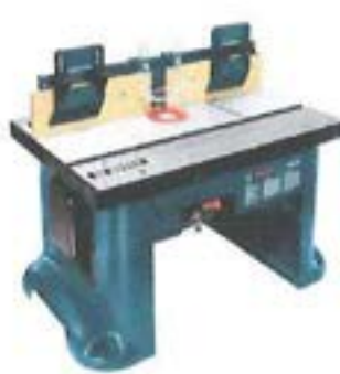
Item 11. Router Table