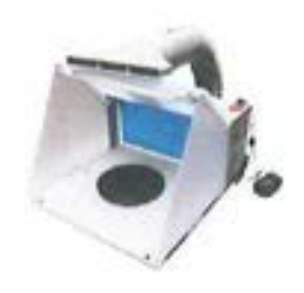
Item 24. Air brush Spray Booth