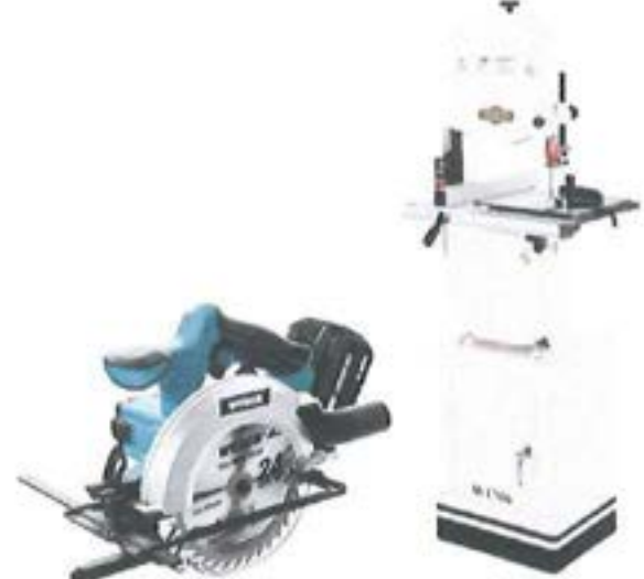
Item 13. Circular Saw