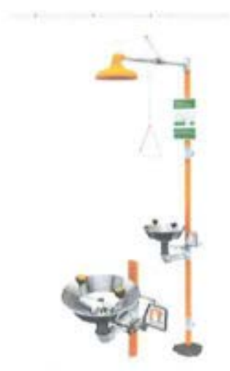
Item 1. Emergency Eye Wash and Shower